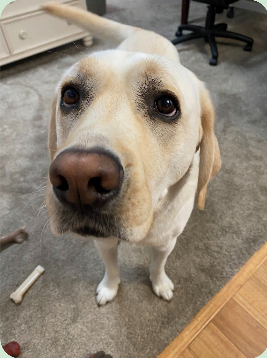
Darwin! Yellow lab